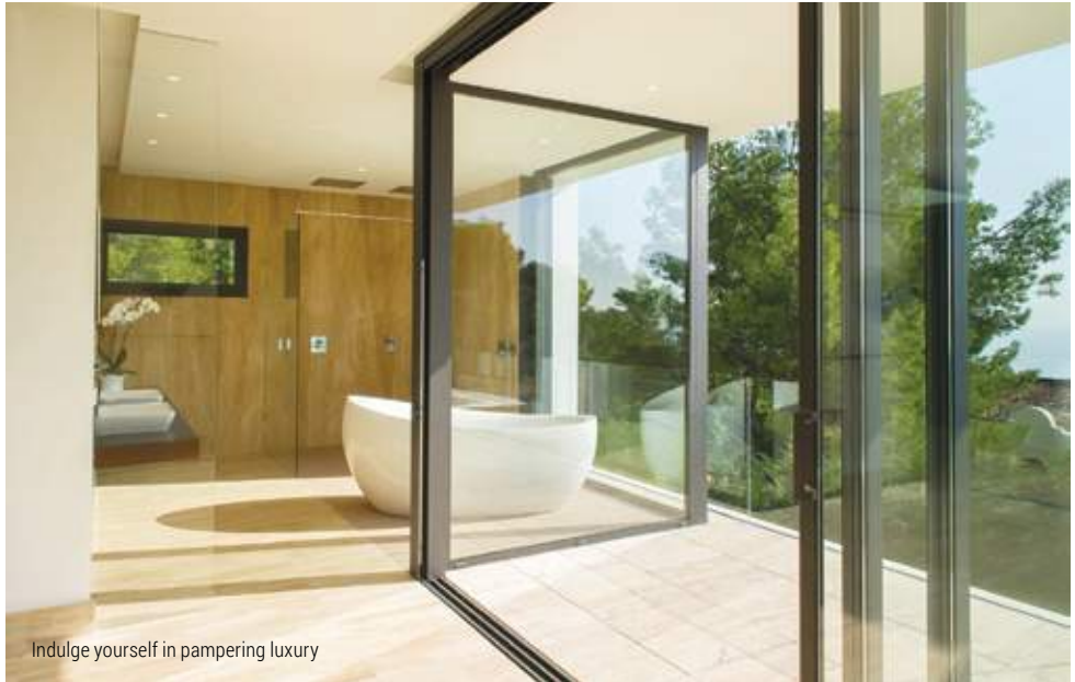
Indulge yourself in pampering luxury