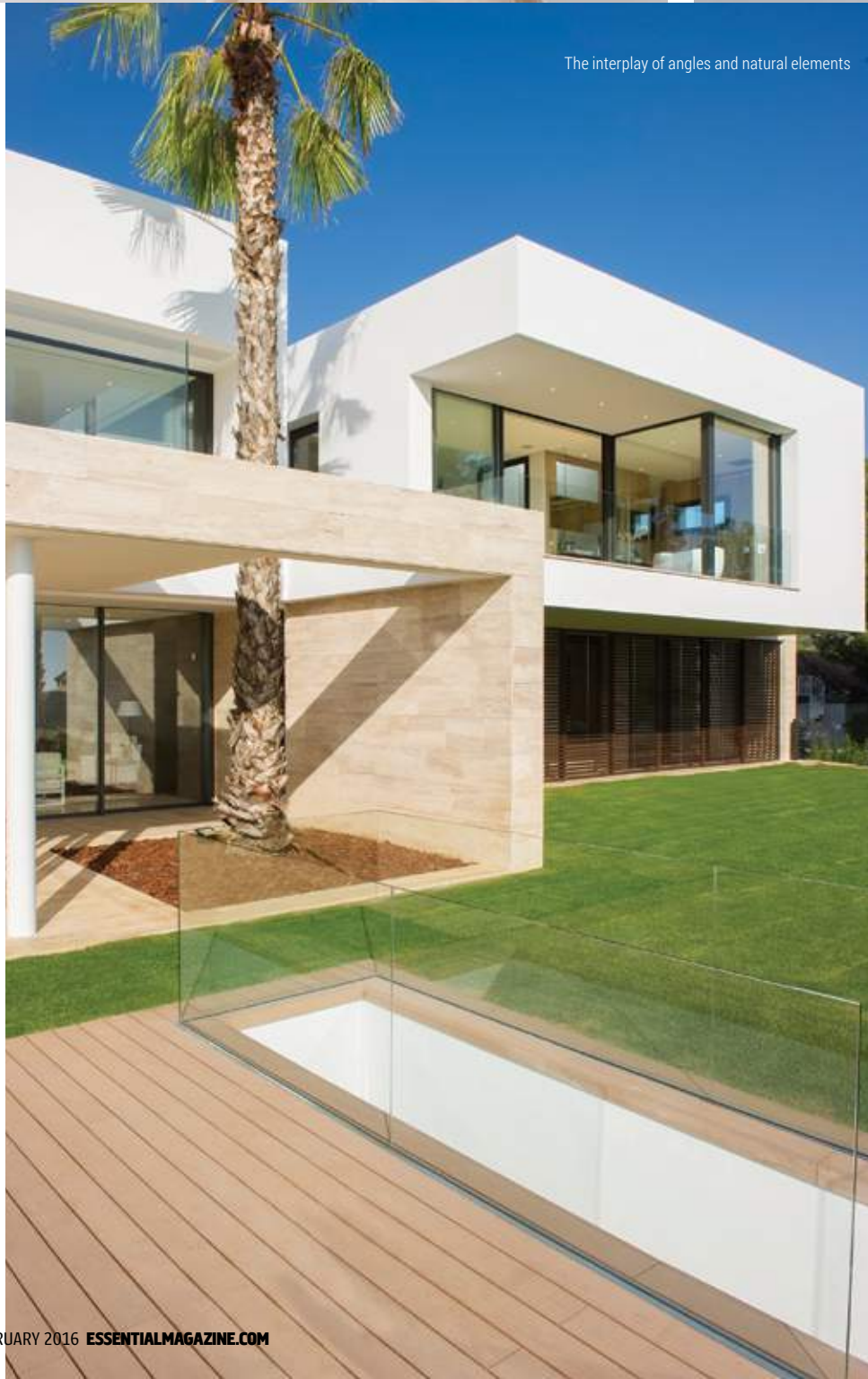
The interplay of angles and natural elements