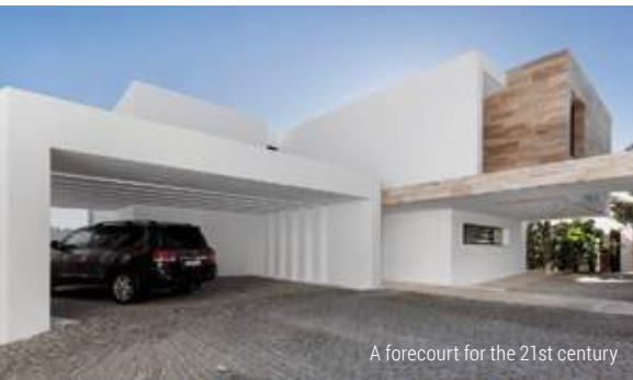
A forecourt for the 21st century