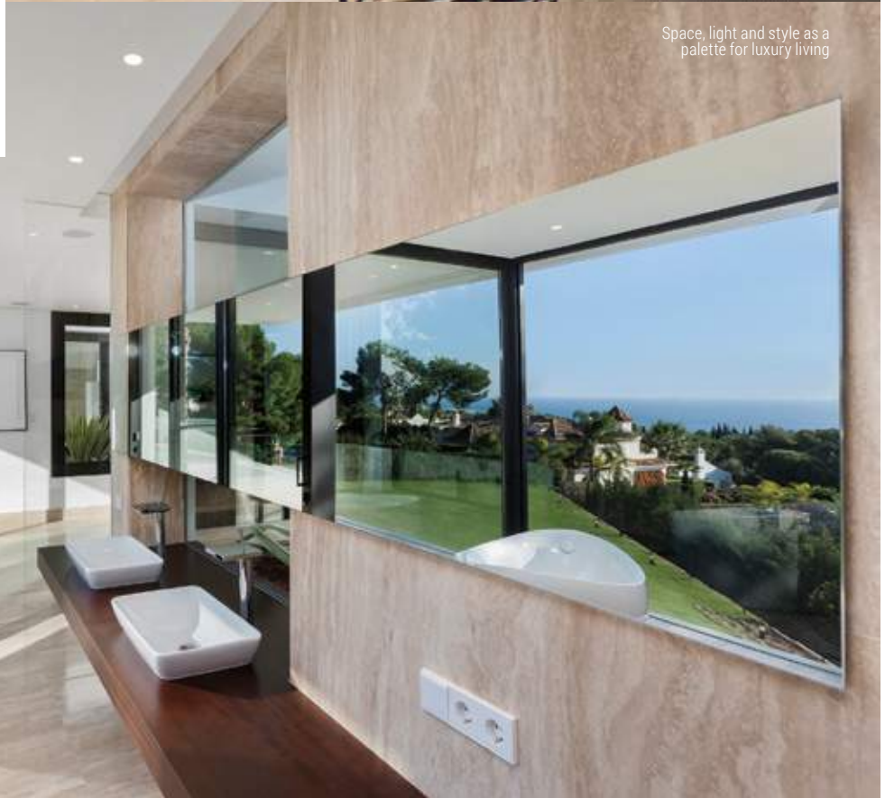
Space, light and style as a palette for luxury living