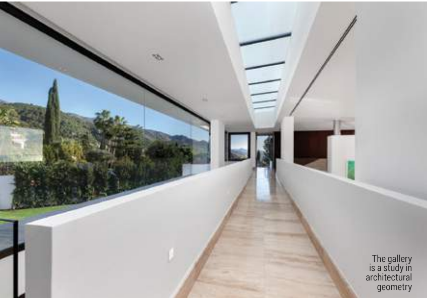
The gallery is a study in architectural geometry