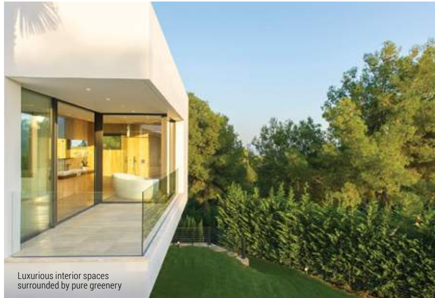
Luxurious interior spaces surrounded by pure greenery