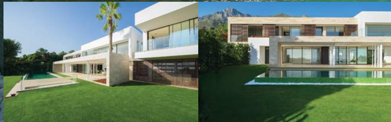
The elegant lines of the villa and pool

It is with all these parameters in mind that an architect sets out to embody the vision of the client, be the latter a commercial or public entity, or a private individual. Which of these it is will again affect the project and the ultimate design and details of the structure in question. To be commissioned to develop the complete concept for a luxurious modern villa in a prime setting such as Sierra Blanca ranks high on the wish list of most architects, including Eulalia Polo and Joaquín Amores of P4 Arquitectos. As a team combining architecture and engineering, they offer the ideal complement of services in a project such as this, ensuring that the aesthetic value of their designs is matched by functionality and technical excellence.